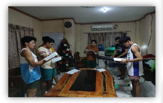
Human Formation and Spiritual Nourishment

manualia, and sports and recreation. These varied activities are meant to develop each one in all aspects of his life.