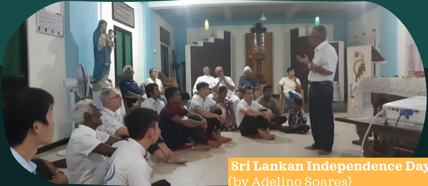
Sri Lankan Independence Day