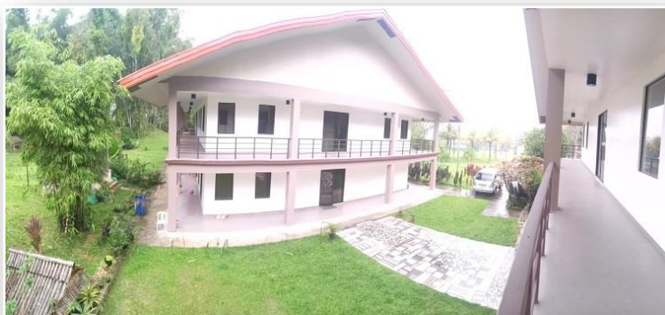
Brothers' residence and guest house