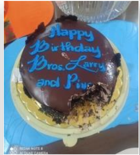
A sweet delight