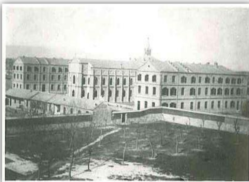
The Provincial House and House of Formation in Chala-Eul

Fifty years after the Marist Brothers had first set foot in China, the Marist Brothers had 22 schools in this country: five in Peking, five in Shanghai, three in Tientsin, four in the province of Shantung, two in Hebei Province, and one each in Hankow, Chungking and Shenyang. The Marist Chinese Province had a Provincial House, two Juniorates, a