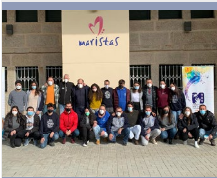
PORTUGAL: ASSEMBLY OF MARCHA COMPOSTELA