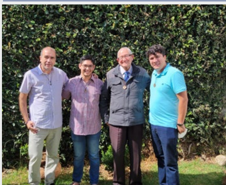
MEXICO: POSTULANCY OF MEXICO OCCIDENTAL