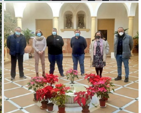
SPAIN: MARIST PATRIMONY TEAM OF MEDITERRANEA PROVINCE