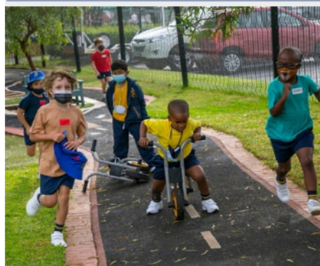
SOUTH AFRICA: ST DAVID'S MARIST INANDA