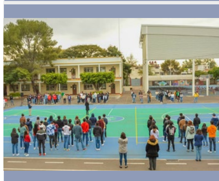
MEXICO: COLEGIO PEDRO MARTÍNEZ VÁZQUEZ, IRAPUATO