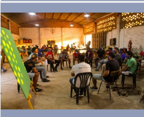
ARGENTINA: SUMMER WORKSHOPS AT MISIÓN NUEVA POMPEYA