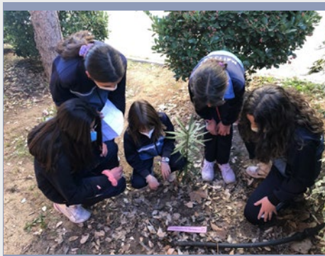
SPAIN: COLEGIO SANTA MARÍA MARISTAS, TOLEDO