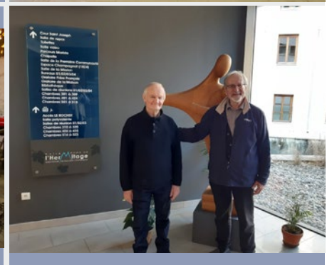
FRANCE: CENTRE D'ACCUEIL L'HERMITAGE