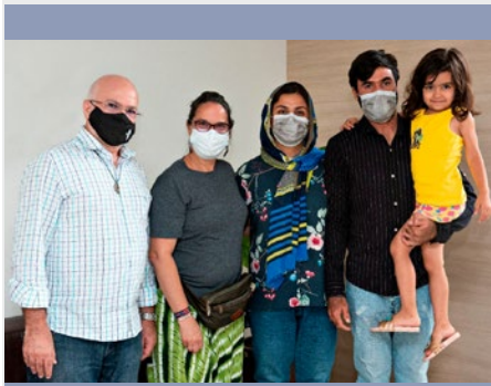
BRAZIL: IN CURITIBA, THE MARISTS WELCOME A MIGRANT FAMILY FROM AFGHANISTAN