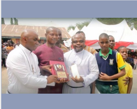
NIGERIA: MARIST BROTHERS' JUNIORATE, UTURU