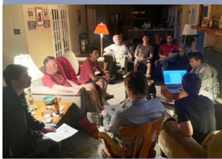
UNITED STATES: AUSTIN COMMUNITY OF WELCOME