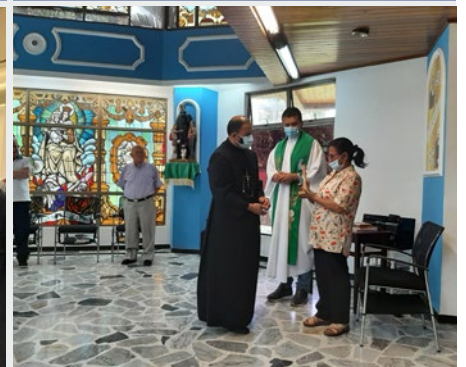
COLOMBIA: MARISTS OF NORANDINA