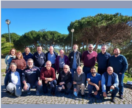
PORTUGAL: EUROPEAN TEAMS OF MISSION AND MARIST LIFE IN LISBON