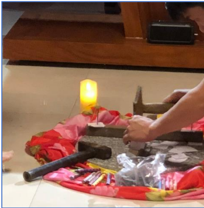
There are times for us to deepen our spiritual life.