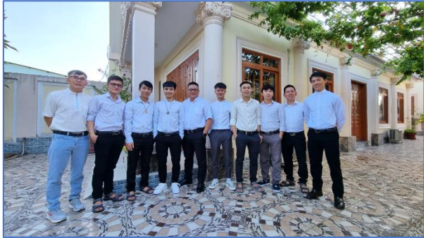
Before going to the Church in the parish.