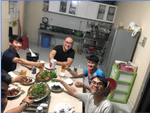
Being together in meal time