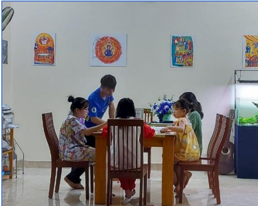
Helping our neighbor students in the evening.