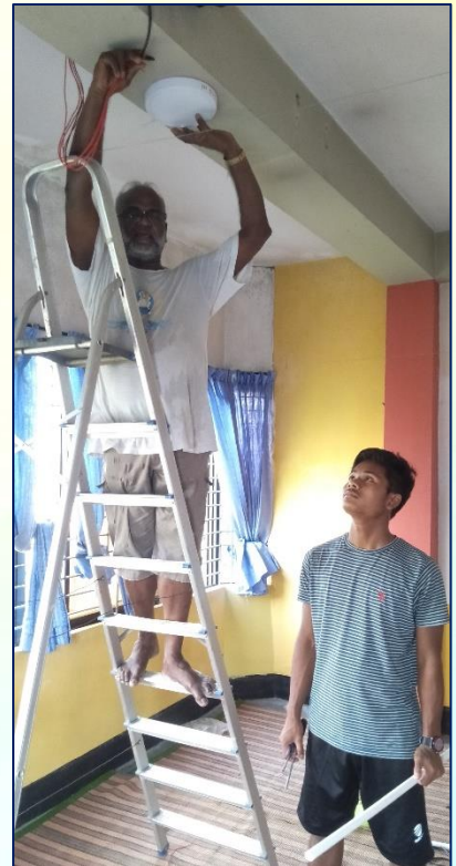
Fitting new lights in our chapel with the help of our Postulants and Candidates.