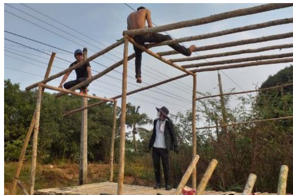
The Project at its movement. We were able to contribute a bit of our skills into building the house, too.