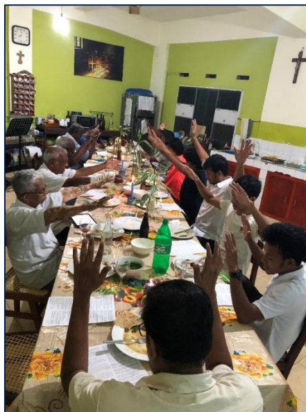
Celebration of Passover meal.