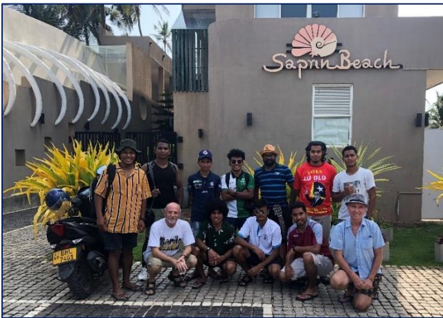
Recollection day near the beautiful beach.

Here there are some pictures from three significant events.