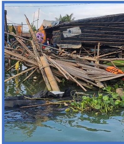
Houses before the Project Houses after a long period of raining season. Water rose high, disrupted their lives, and then left the house decayed.

The Housing Project at its start Distributing sticks and rubber sheets to the people. It was quite a hard, busy day for us all to distribute hundreds of long, heavy sticks to the people. Thanks to our brothers and lay volunteers