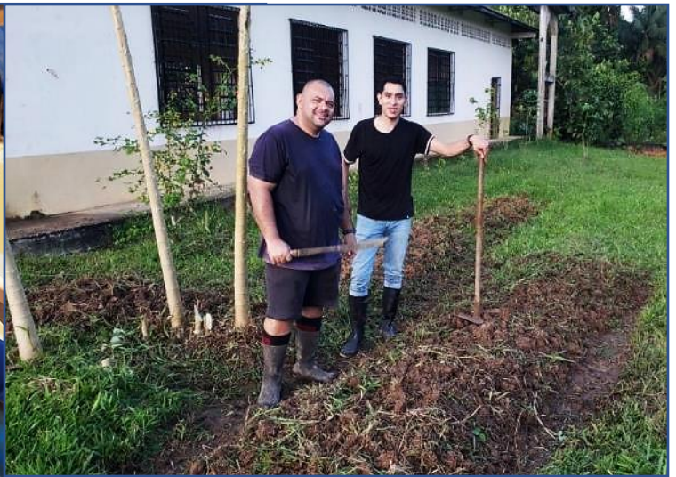
Doing some gardening in one of the communities with a LaSalle Layman