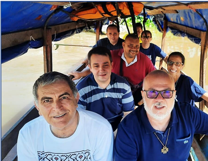
Boat ride with the four Provincials of the Region