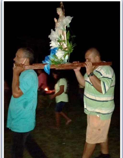
Our Lady of Fatima procession in one of the communities.