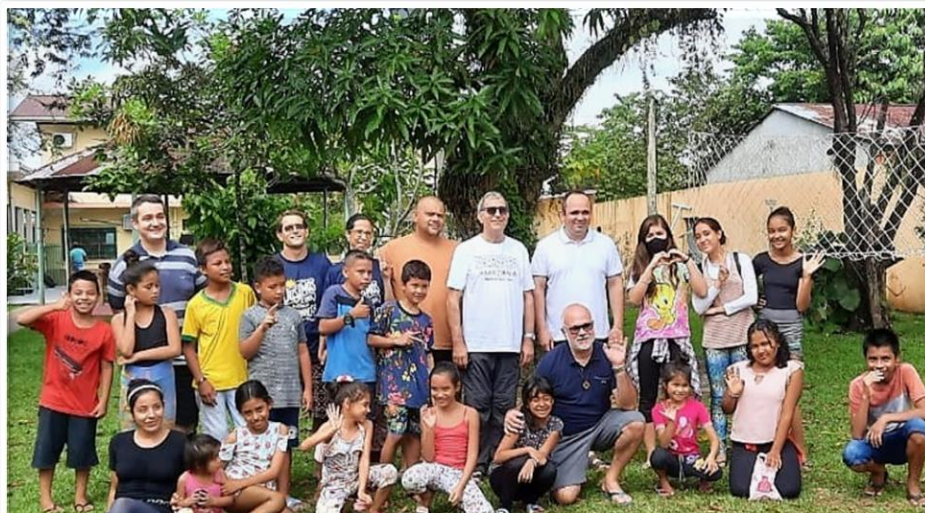
The four Provincials with some of the children who come to the Centre

Our Marist Centre is running smoothly with more than 60 students from around Tabatinga. We offer: