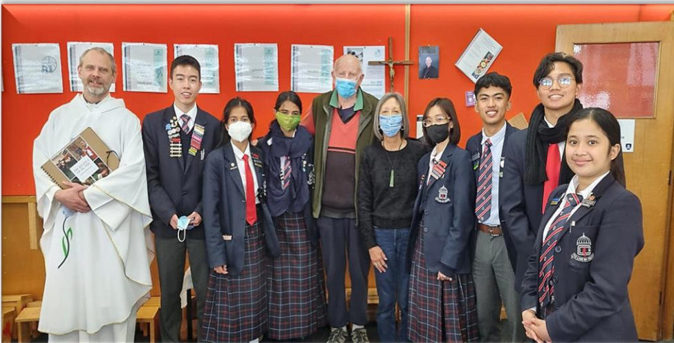
Some Remarkable Activities from Catholic Cathedral College Christchurch, New Zealand. From Br Osmund