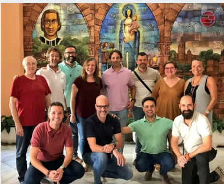
SPAIN: FIRST MEETING OF THE PROVINCIAL HR TEAM AT THE MARIST BROTHERS' SCHOOL IN VALENCIA.