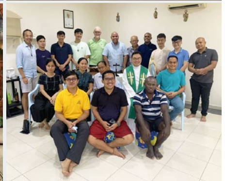
MALAYSIA: MARIST PREPARATION PROGRAM FOR FINAL VOWS AT CHAMPAGNAT YOUTH CENTRE