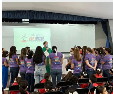
MEXICO: PRESENTATION OF THE GOOD PILGRIM MOTHER TO THE MARIST FAMILIES