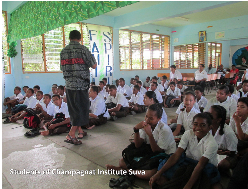
Students of Champagnat Institute Suva