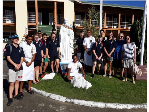
BELOW: Australian Immersion group visit Marist Brothers High School Suva