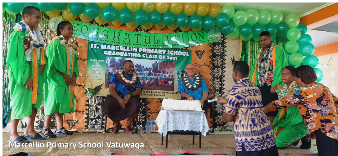
Marcellin Primary School Vatuwaqa