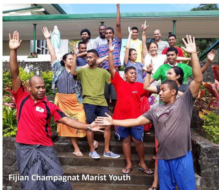
Fijian Champagnat Marist Youth