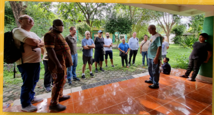
ICEA participants visited Marcellin's Boy at Marcellin Homes in Katangawan, General Santos City, Philippines.