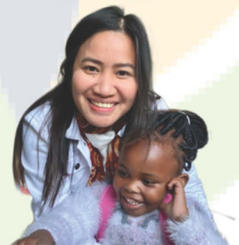
I hope that by virtue of my presence alone, waves of inspiration will spread, allowing many more individuals to experience the thrill of extending love to children and young people especially in the margins of life.