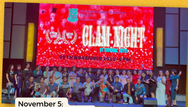
November 5: Kuching Community Performance from SJIS during SJFS Annual dinner.