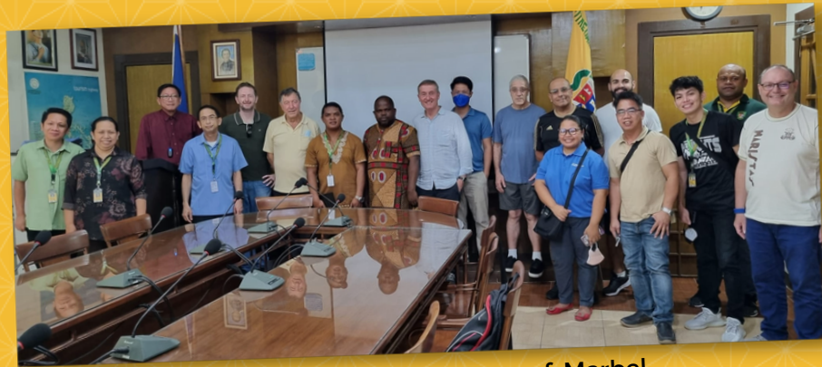
ICEA Participants visited Notre Dame of Marbel University, Koronadal City, Philippines.