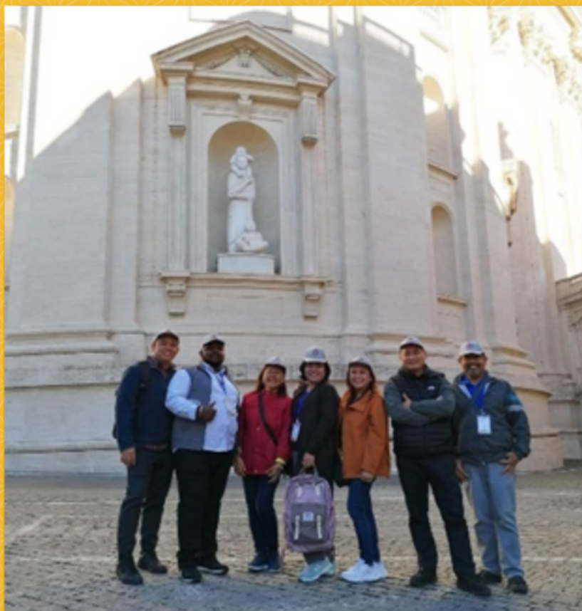
Asia Region Participants