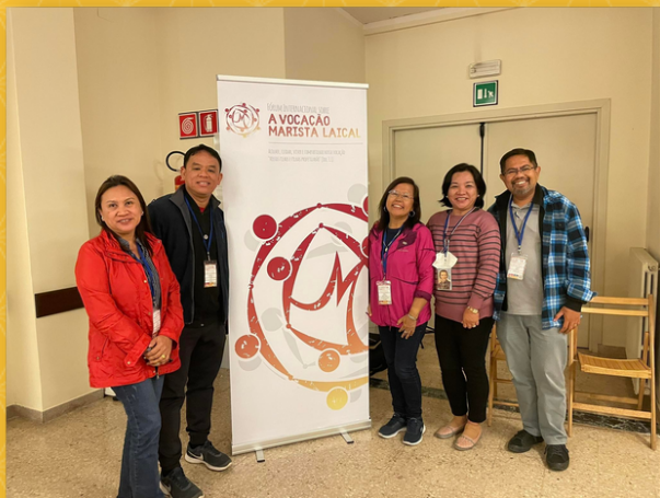
East Asia Province Participants