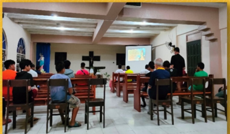
The Marcellin Boys during their prayer time.