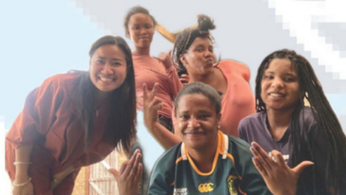
Living among the laity and brothers has taught me to have an open heart, to deal with the realities of differences and disputes within the community, and to appreciate diversity.

Personally, I feel humbled and pleased to be a part of the Marist International Community. The shared experiences and fostering obstacles have made my heart happy and joyful. The Marist community influenced me to develop, respect others' needs, and have an accommodating mindset toward other people in various circumstances. Living among the laity and brothers has taught me to have an open heart, to deal with the realities of differences and disputes within the community, and to appreciate diversity. I will always be indebted to my Marist family for all of the inspirations, enlightenments, joys, hopes, perspectives, and a sense of belonging