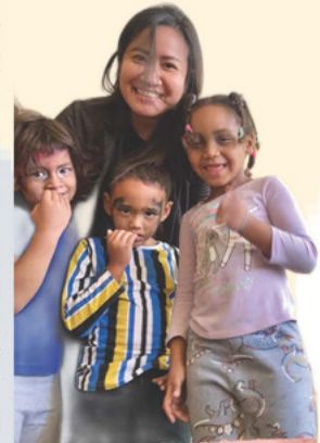
Serving the young people in various ways, particularly by being there for them, has always been a joy.