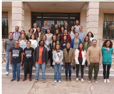
SPAIN: XX HERMITAGE, SCHOOL OF EDUCATORS