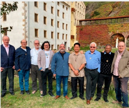
FRANCE: COMMUNITY OF NOTRE DAME DE L'HERMITAGE