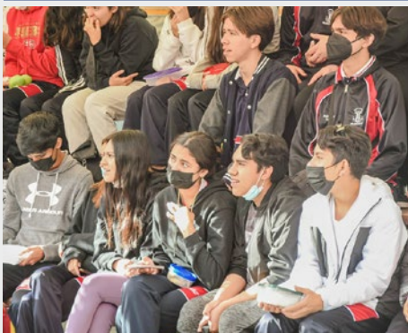
MEXICO: COLEGIO PEDRO MARTÍNEZ VÁZQUEZ, IRAPUATO