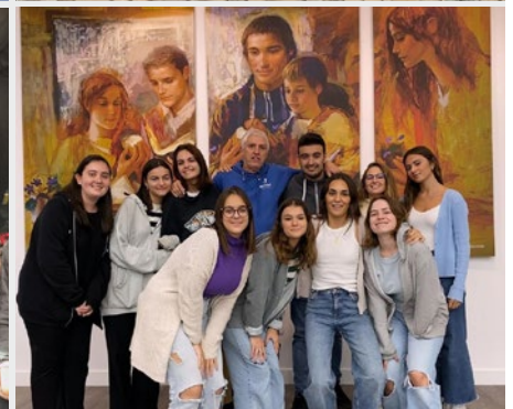
SPAIN: MARCHA COMPOSTELA - VALLADOLID