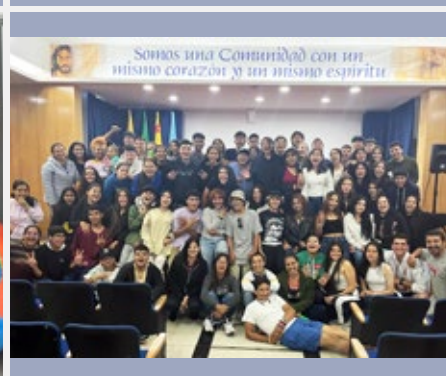
COLOMBIA: MYM VOLUNTEERS FROM THE MARIST INSTITUTIONS OF POPAYÁN AND CALI.