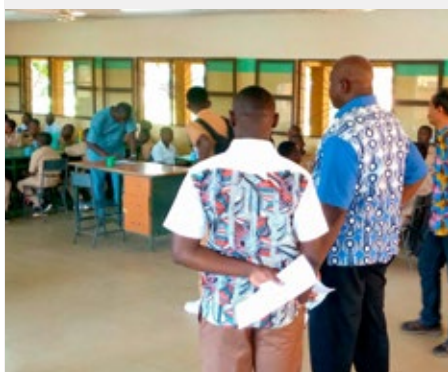
CÔTE DIVOIRE: COLLÈGE MARCELLIN CHAMPAGNAT, KORHOGO