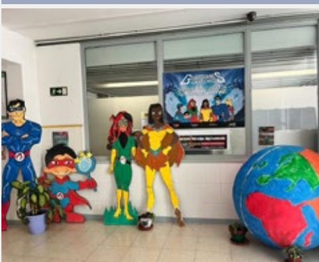
SPAIN: COLEGIO CHAMBERÍ