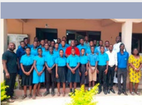
GHANA: OUR GOOD MOTHER SCHOOL, ASHALAJA