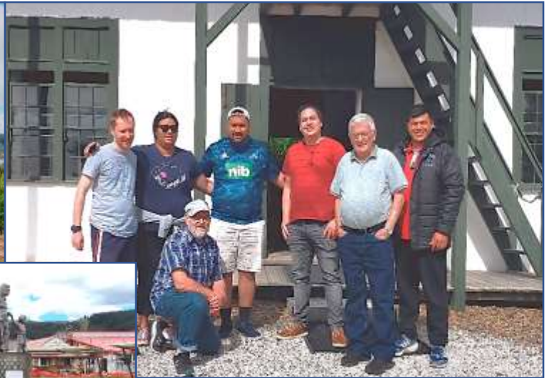
At Pompallier mission