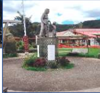
sculpture tells the