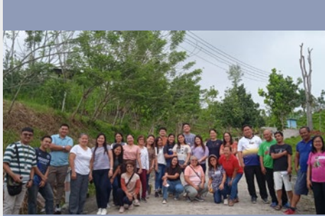
PHILIPPINES: MARIST FAMILY LENTEN RECOLLECTION – MARIST ASIA SPIRITUALITY AND MISSION CENTER