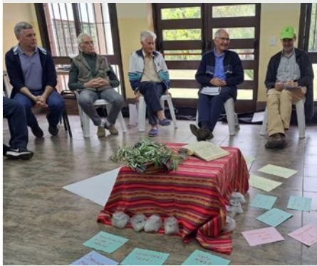
COMMUNITY ANIMATORS' ENCOUNTER IN LUJÁN.