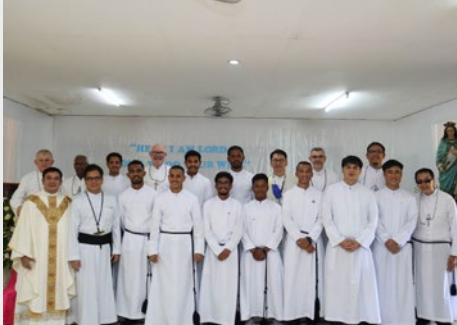
PHILIPPINES: FIRST VOWS IN TAMONTAKA