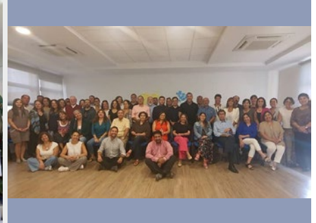
CHILE: FIRST MEETING OF THE YEAR OF MARIST DIRECTORS IN SANTIAGO