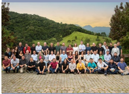
BRAZIL: BCS PROPHETIC SERVANT LEADERSHIP COURSE