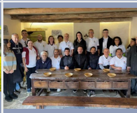
CHILE: MARIST VOCATIONAL ASSEMBLY IN SANTIAGO