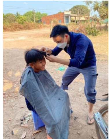
Marist professional Barber