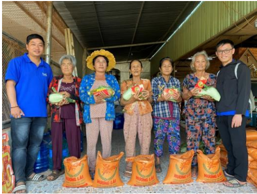
Food program before Lunar New Year