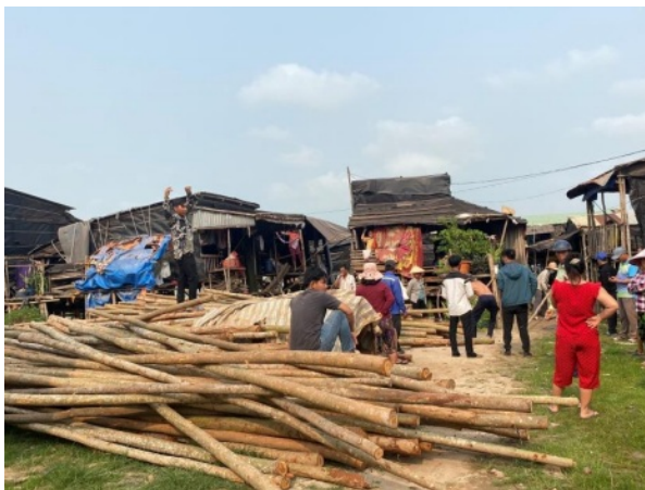
Launching of the House Repair Project