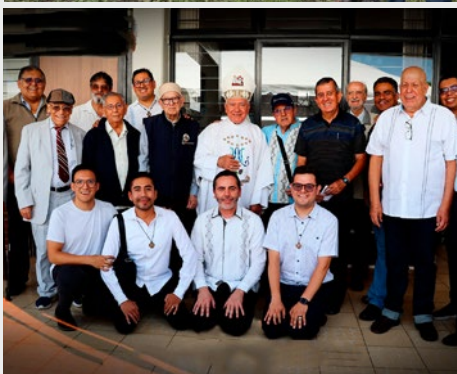
MEXICO: 60 YEARS OF THE INSTITUTO MORELOS, URUAPAN