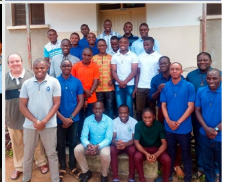
TANZANIA: POSTULANTS IN MWANZA