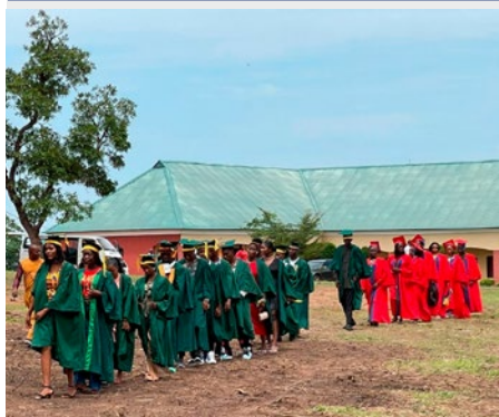
NIGERIA: 4TH MATRICULATION CEREMONY OF THE MARIST POLYTECHNIC ENUGU