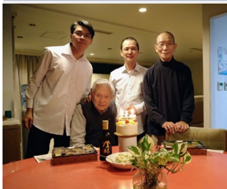
JAPAN: MARIST COMMUNITY IN KOBE