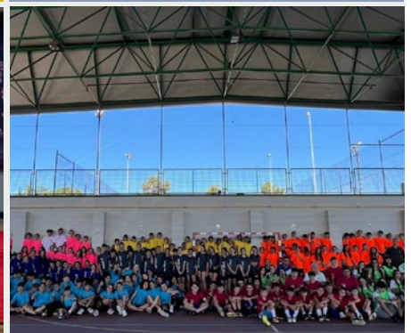
SPAIN: PROVINCIAL SPORTS EVENT IN LA RIOJA