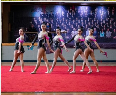
CHILE: RHYTHMIC GYMNASTICS FESTIVAL AT COLEGIO MARISTA SANTIAGO