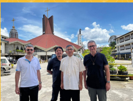
With the Bishop of Sibiu.