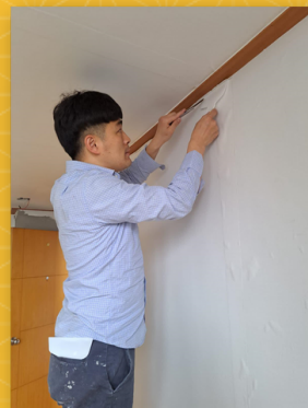
Last April 15, the Brothers put new wallpaper in one room of our house in Seoul.