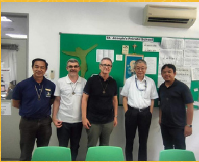
With the CEO of St. Joseph Schools-Kuching