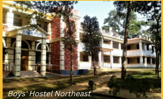
Boys' Hostel Northeast