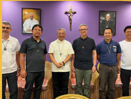
With the Archbisihop of Kuching.