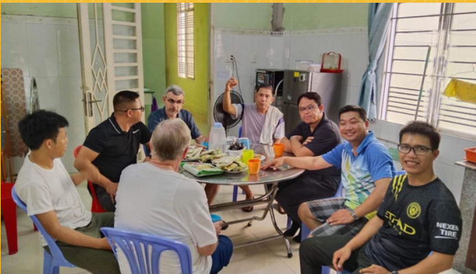
April 16: Marist Brothers Pre-Novitiate House, Cu Chi, Vietnam