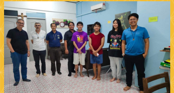
With the students at Marist Hostel