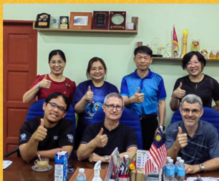
With the Lay Marists of Catholic High School Sibiu