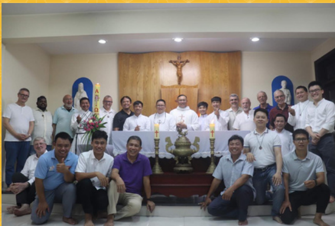
April 20-23: MDA Vietnam Country Recollection and Assembly at Vung Tau, Vietnam, at Our Lady of Phuoc Hai Cistercian Monastery.