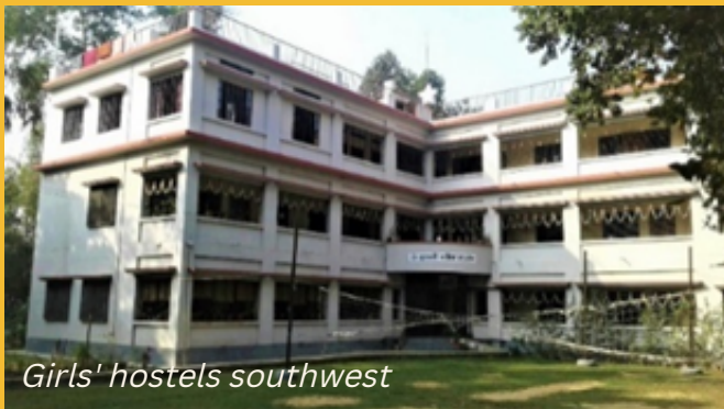
Girls' hostels southwest