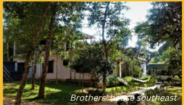
Brothers' house southeast

Their hostel and the chapel were completed ahead of time but were occupied after 1 year and a half due to covid19 pandemic.