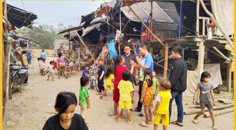
April 15: Marist Brothers' Ministry with Undocumented Migrants