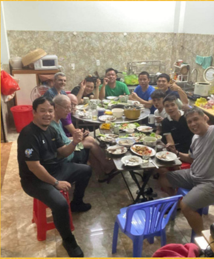
April 14: Marist Student House, Saigon, Vietnam

Visit to Vietnam, Marist District of Asia (MDA), April 14-24, 2023