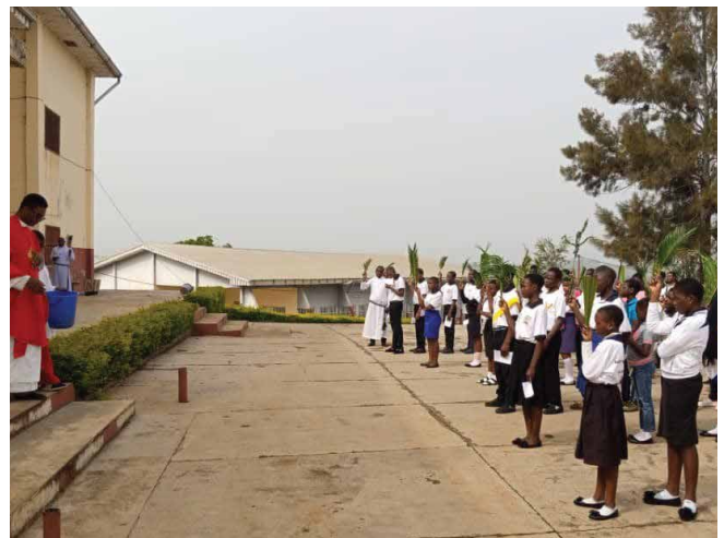
Palm Sunday at SACC, Bafut