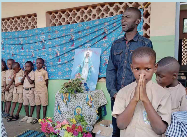
May devotion at Collège Champagnat, Bouaké

As part of the team's commitment to this initiative, they organized a fraternal visit to the Kwadaso Kwenase Rehabilitation Centre on May 12, 2023. The Center provides care for physically challenged boys and girls, as well as young men and women, through the generous support of kind and generous individuals. Accompanying the Team on this visit were six students representing various academic levels, two teachers, and two Brothers. The collaborative efforts of the Pastoral Team and the school resulted in the presentation of food items to the center, alongside a monetary donation of Ghc 1,000.00, enclosed in an envelope. The visit to the Rehabilitation Center proved to be a deeply moving experience. The residents warmly received us, expressing their appreciation through beautiful singing, drumming, and dancing.