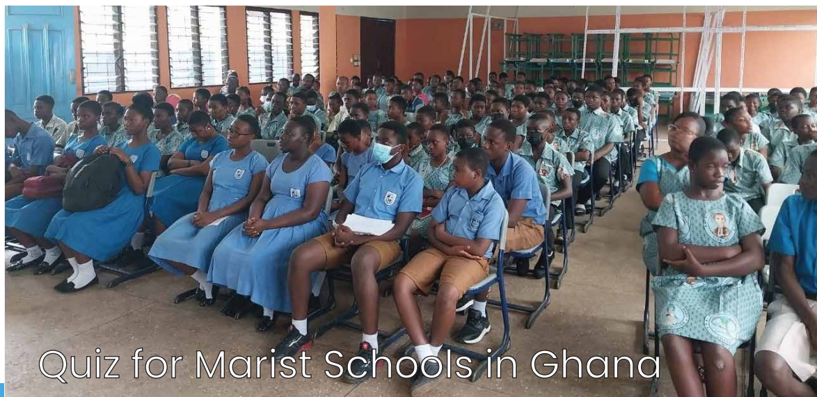
Quiz for Marist Schools in Ghana