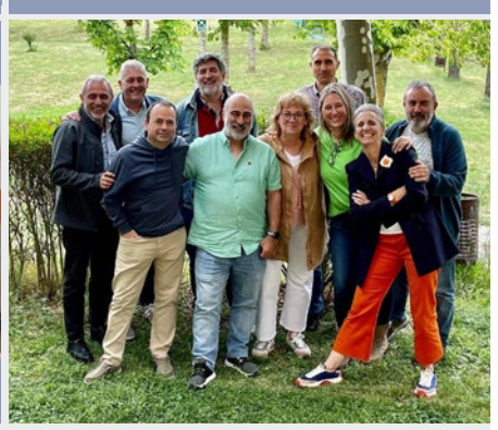
BRAZIL: X INTEGRA CONFESSIONAL MEETING OF FTD EDUCAÇÃO