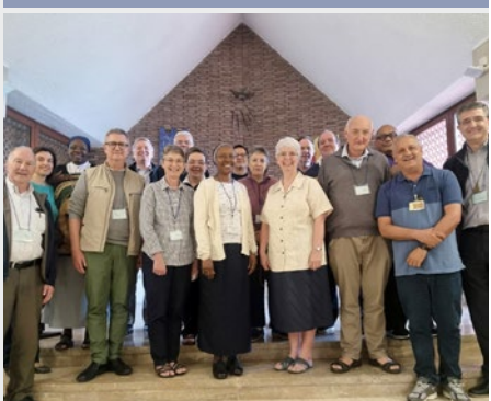
ITALY: MEETING OF THE 4 BRANCHES OF THE MARIST FAMILY IN NEMI