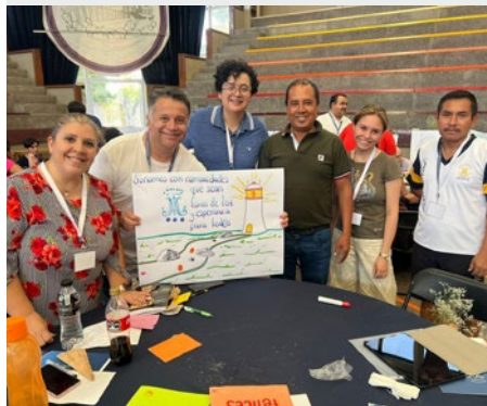
MEXICO: FIRST PROVINCIAL ASSEMBLY IN MEXICO CITY