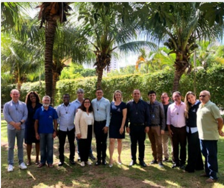
BRAZIL: PROVINCIAL COUNCIL OF BRAZIL CENTRO-NORTE IN NATAL