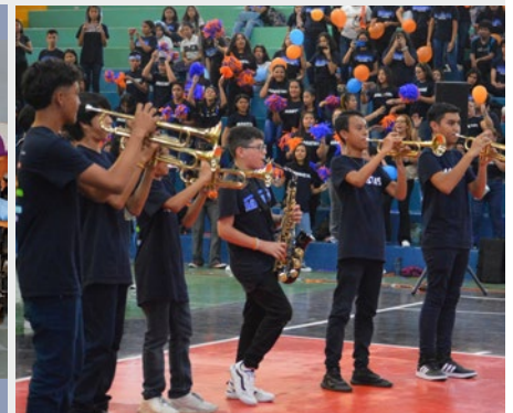
EL SALVADOR: 100 YEARS OF MARIST PRESENCE IN CENTRAL AMERICA