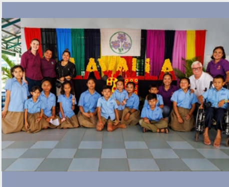
CAMBODIA: 25TH ANNIVERSARY LAVALLA SCHOOL IN KANDAL