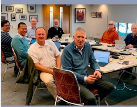
AUSTRALIA: MEETING OF THE STAR OF THE SEA'S PROVINCIAL COUNCIL IN BRISBANE