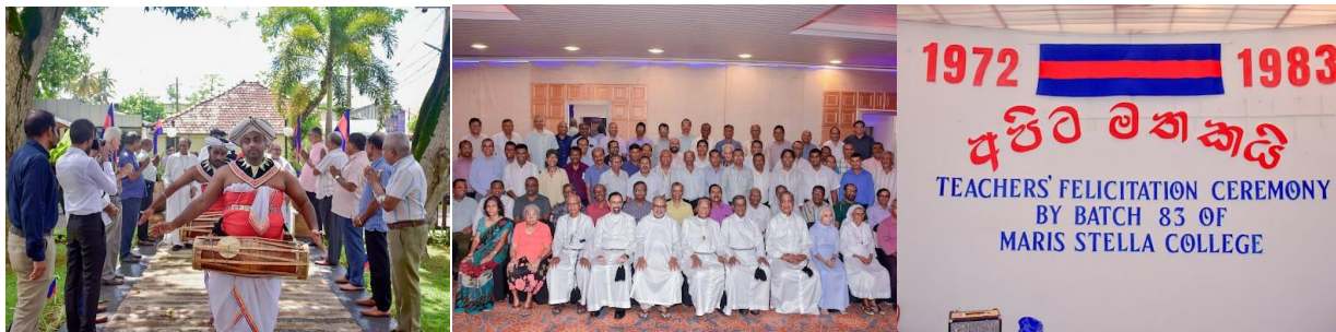
MSC 83 BATCH

On 1 st May 2023, a ceremony under the theme "Apita Mathakai" was held at "Dinindu" banquet hall, Seeduwa to felicitate 25 teachers (including a Rev. Father, Rev. Brothers & Rev. Sisters) who taught at Maris Stella College during 1972-1983 period. On that day, about 53 old boys who studied during this period were present and some more old boys who live in Sri Lanka and overseas witnessed this event live via Face Book. All who participated had a wonderful and fruitful session where all were able to reminisce memorable incidents of the past. A "Theme Song" specially composed for the event was sung during the function. Everybody enjoyed the delicious lunch served while being entertained to the live music. The departed teachers (taught during 1972-1983) were also fondly remembered while their photographs displayed on a screen followed by a brief description. Batch mates took turns and spoke about each teacher by appreciating their invaluable service. Gifts and special mementos were also presented to each teacher. Seeing their faces brimming with Joy, we realized the value of organizing such an event for teachers.