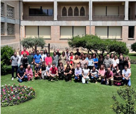
SPAIN: MANAGEMENT TEAM MEETING IN LARDERO