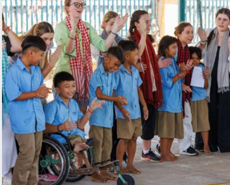
CAMBODIA: ST. RITA'S COLLEGE BRISBANE VISITS THE LAVALLA PROJECT