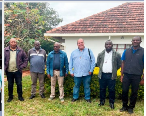
KENYA: COMISION INTERNACIONAL "REIMAGING MIC AND MIUC" EN NAIROBI