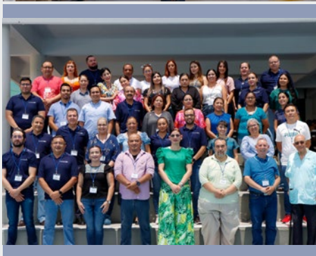
MEXICO: CLOSING OF THE COURSE "SPIRITUAL COMPETENCE" IN CRISTOBAL COLÓN, WESTERN MEXICO