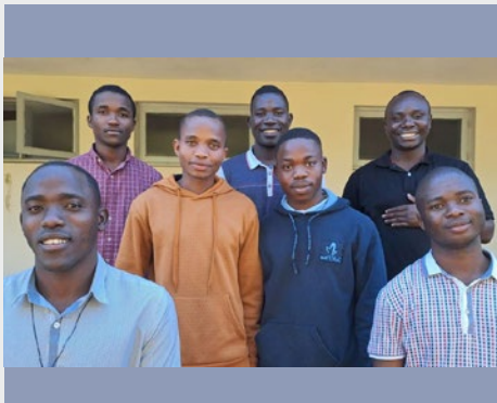
MOZAMBIQUE: NOVICES OF THE SOUTHERN AFRICA PROVINCE, IN MATOLA