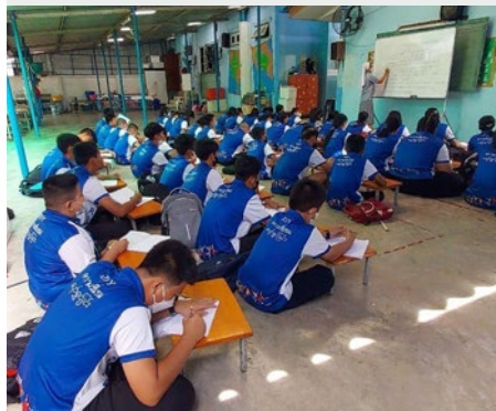
THAILAND: MARIST CENTRE FOR MIGRANTS, SAMUT SAKHON