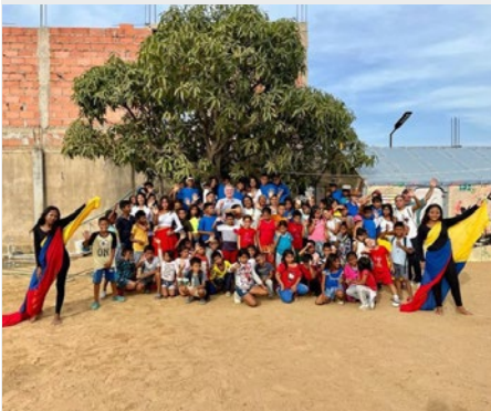
COLOMBIA: VISIT OF BR. ERNESTO, SUPERIOR GENERAL TO THE COMMUNITY OF MAICAO