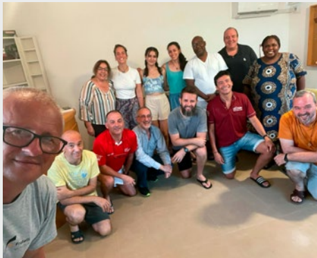
LEBANON: FRATELLI COUNCIL VISITS THE FRATELLI PROJECT IN LEBANON