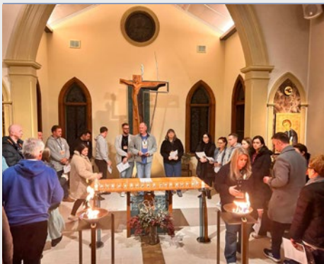
AUSTRALIA: MARISTS GATHERED IN MITTAGONG