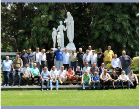
MEXICO: ASSEMBLY OF THE MARIST BROTHERS OF THE PROVINCE OF MÉXICO OCCIDENTAL