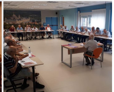
SPAIN: RETREAT OF THE BROTHERS OF THE IBERICA PROVINCE IN EL ESCORIAL