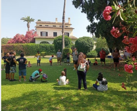
ITALY: SUMMER CAMP IN THE CIAO – LAVAL-LA200> SIRACUSA