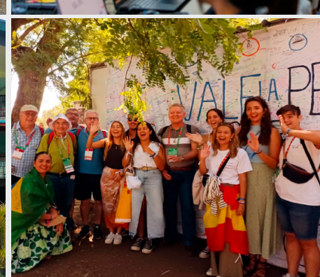
ECUADOR: ANNUAL SPIRITUAL RETREAT "GENERATING LIFE"