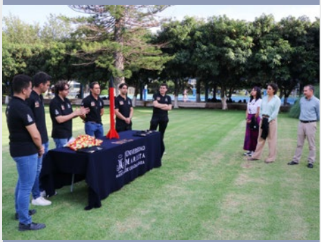
MEXICO: UNIVERSIDAD MARISTA DE GUADALAJARA

SYRIA: PSYCHOLOGICAL RESILIENCE PROGRAM IN THE BLUE MARISTES IN ALEPPO