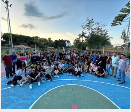
COLOMBIA: SART MEETING NORANDINA PROVINCE