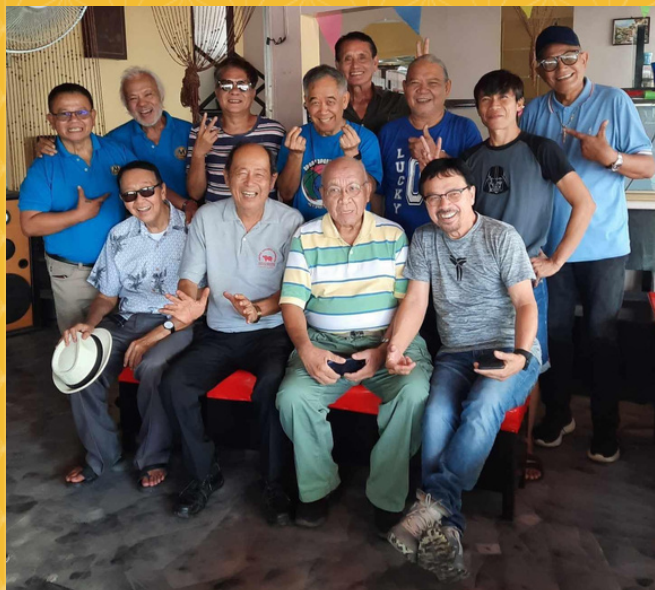
MAREX MINDANAO GROUP