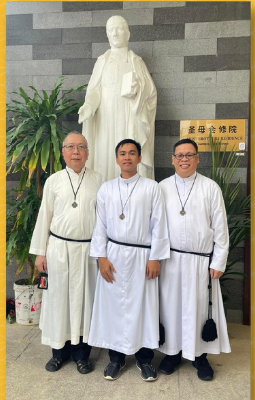
The Brothers in the Champagnat House Community