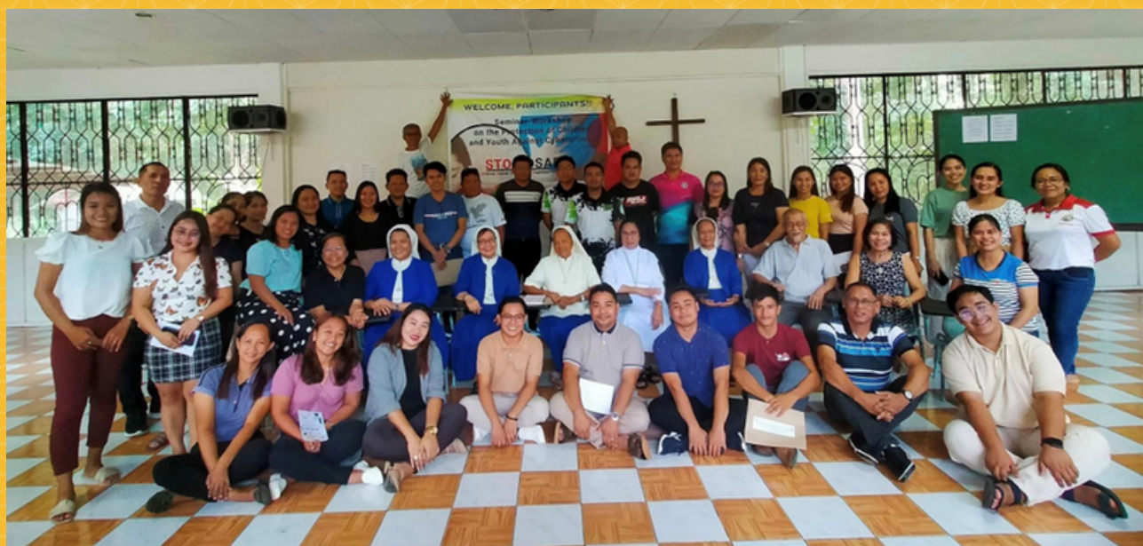
Last July 29-30, Fifty-five participated in the Seminar Workshop on the advocacy against Online Sexual Abuse and Exploitation of Children. Participants came from the 15 NDEA member schools in Kidapawan and Midsayap areas.