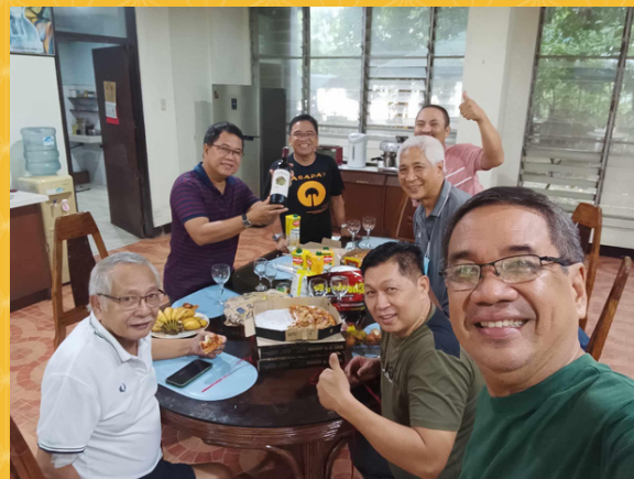
MAREX MANILA GROUP