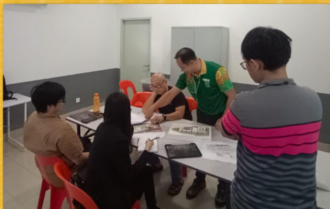
August 5: Discussion with the constructors on the future of Saint Joseph International School