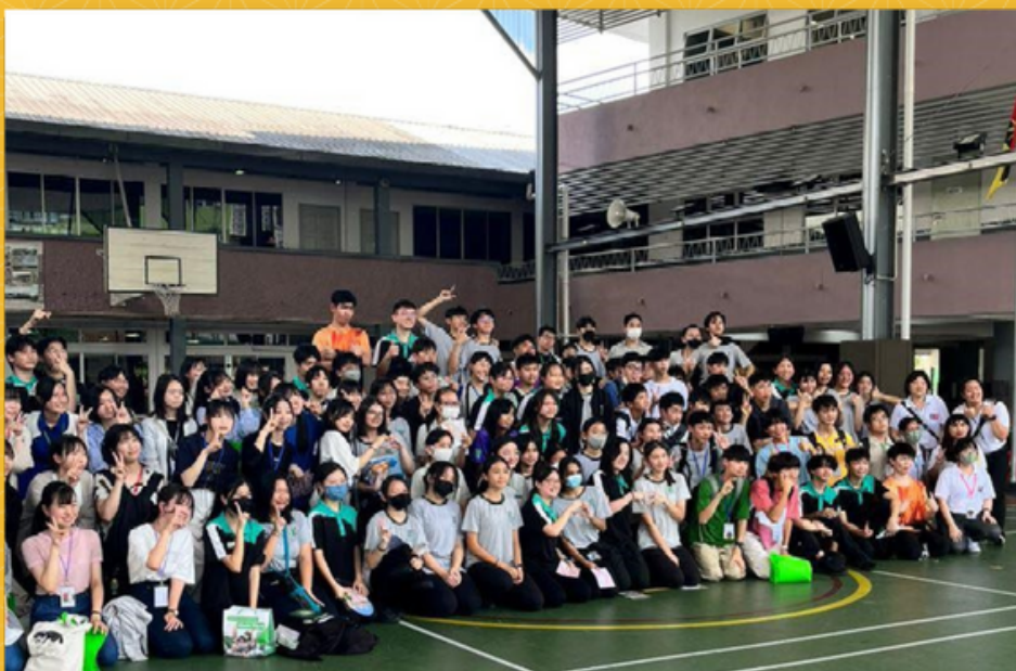
August 1: Forty-seven (47) high school students from Showagakun Shuei Junior and Senior High School visited the Saint Joseph International School in Kuching, Sarawak, Malaysia.