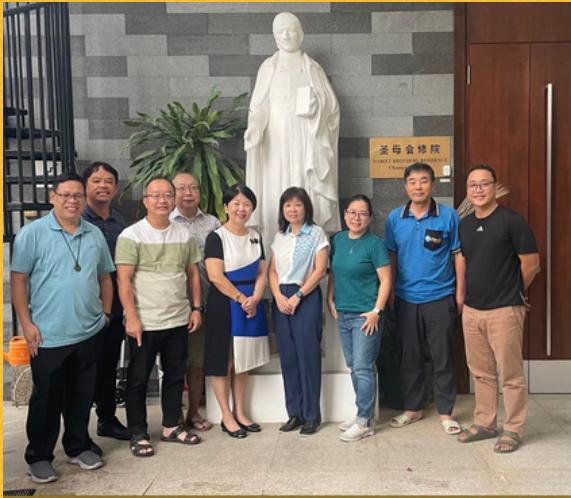
The Provincial Council visited Lay Marist Administrators of Marist Stella High School Singapore

August 1-3: Provincial Council Meeting number 10 at Champagnat House, Singapore