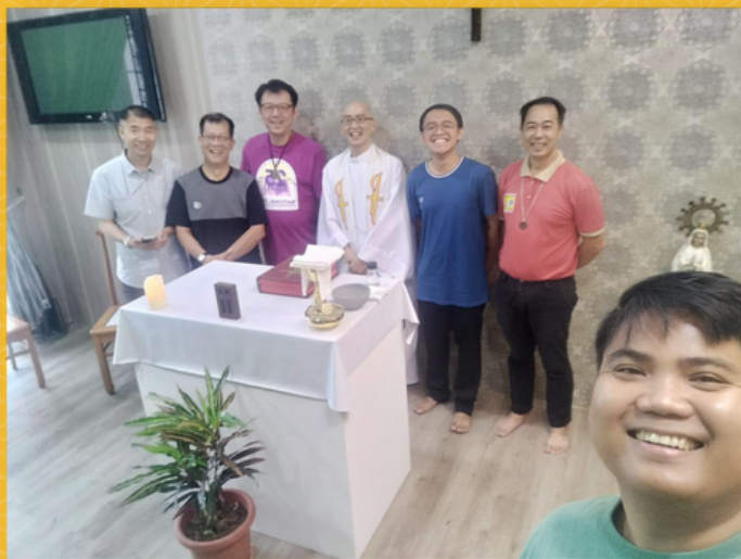
August 5: Marist Kuching Community hosted the monthly Kuching male religious group fellowship this August 2023