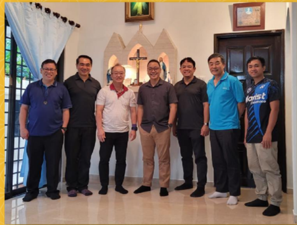
August 1 morning: The Provincial Council visited the Parish of Immaculate Heart of Mary where Champagnat House belongs