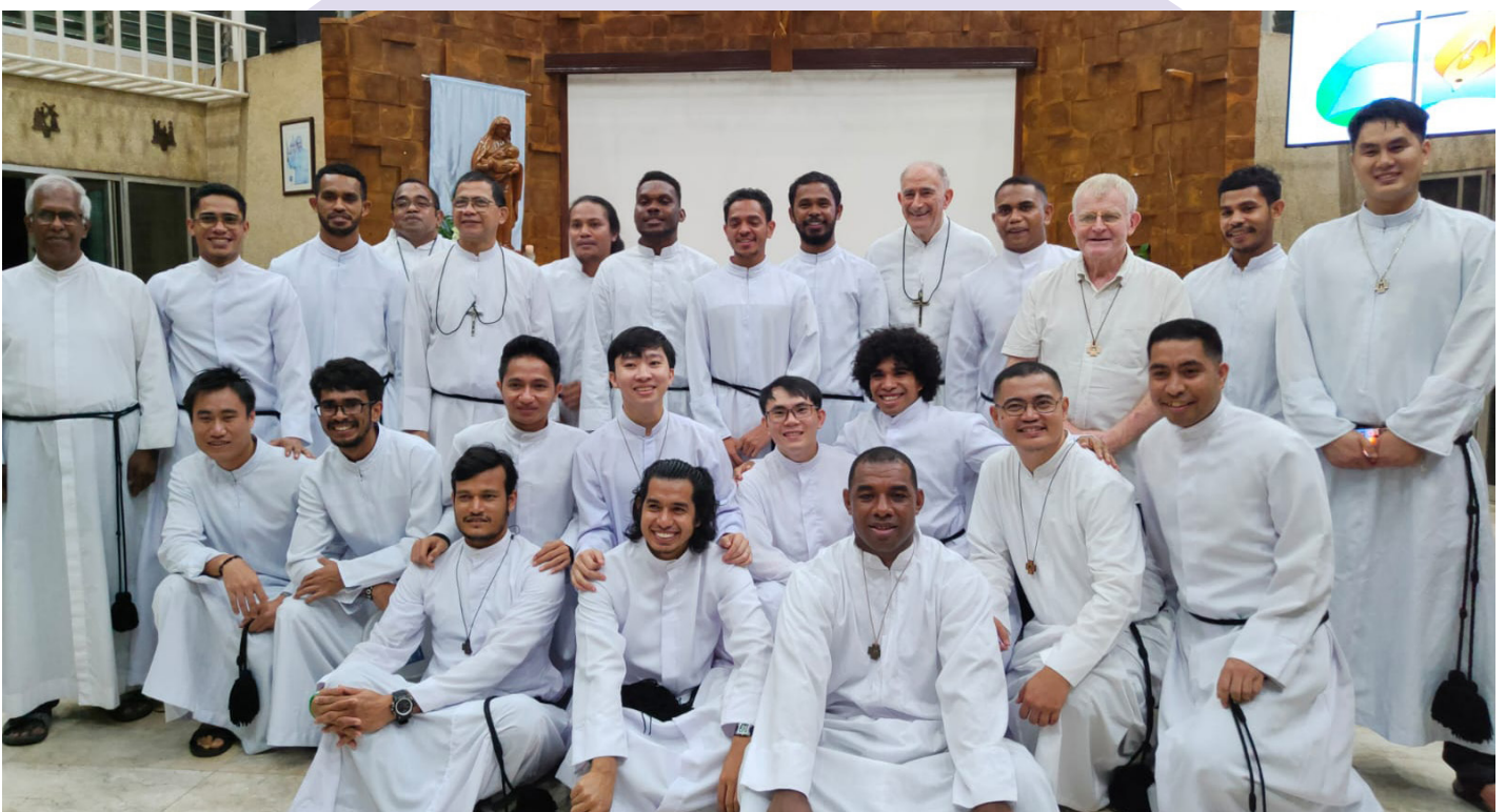
MAPAC community after renewal of vows.