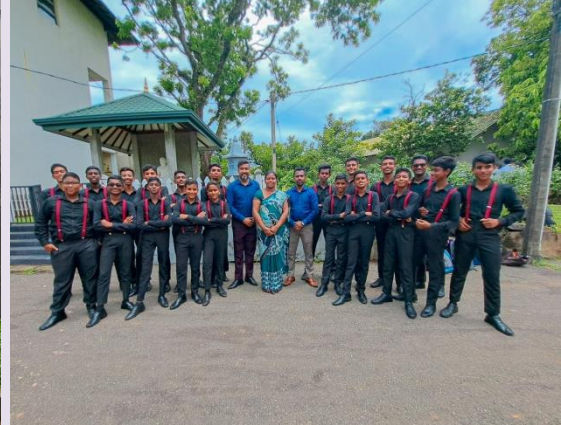
Media Unit Thimbirigastakuwa