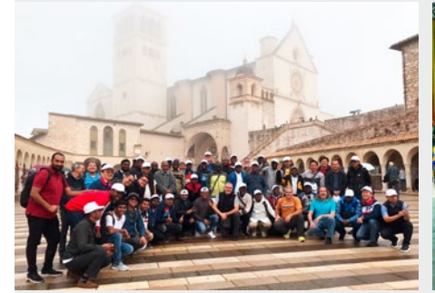
ITALY: TUTTI FRATELLI PROGRAM