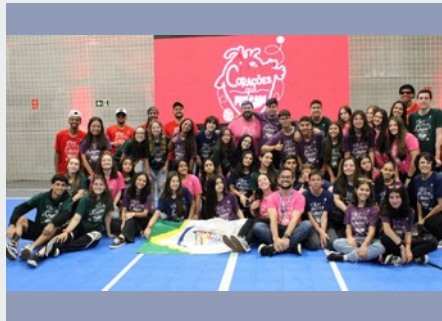
BRAZIL: MARIST YOUTH GATHERING