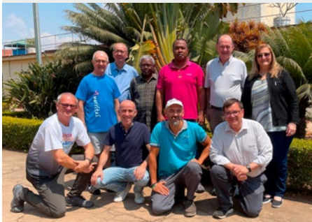
MADAGASCAR: MEETING OF THE EXECUTIVE COMMITTEE OF THE MARIST INTERNATIONAL SOLIDARITY NETWORK