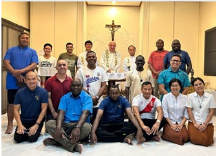
THAILAND: MARIST MISSION STUDIES WORKSHOP IN BANGKOK