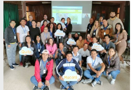
ECUADOR: MEETING OF THE MARIST WORKS OF ECUADOR WITH CHAMPAGNAT GLOBAL