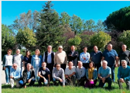
SPAIN: MEETING OF THE EXTENDED COUNCIL OF THE PROVINCE OF COMPOSTELA