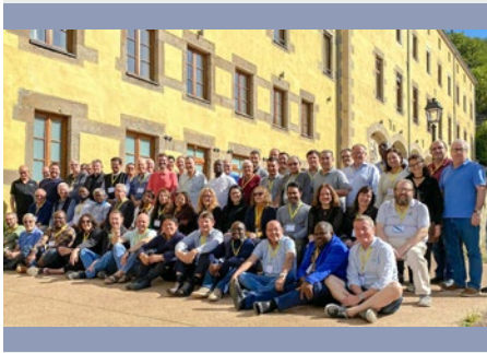
FRANCE: INTERNATIONAL BURSAR'S MEETING