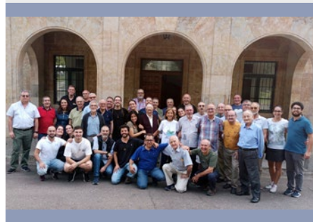
SPAIN: MEETING OF BROTHERS AND LAY PEOPLE FROM COMPOSTELA WHO WORK IN THE VOCATIONAL MINISTRY