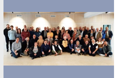
GERMANY: LAUNCH OF WEST CENTRAL EUROPE DISTRICT, FURTH