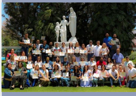
MÉXICO: PARTICIPANTS OF THE MARISTIZATION COURSE IN GUADALAJARA