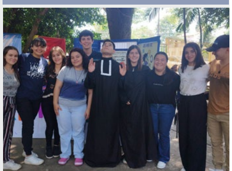
PARAGUAY: MARIST YOUTH MINISTRY, LIMPIO