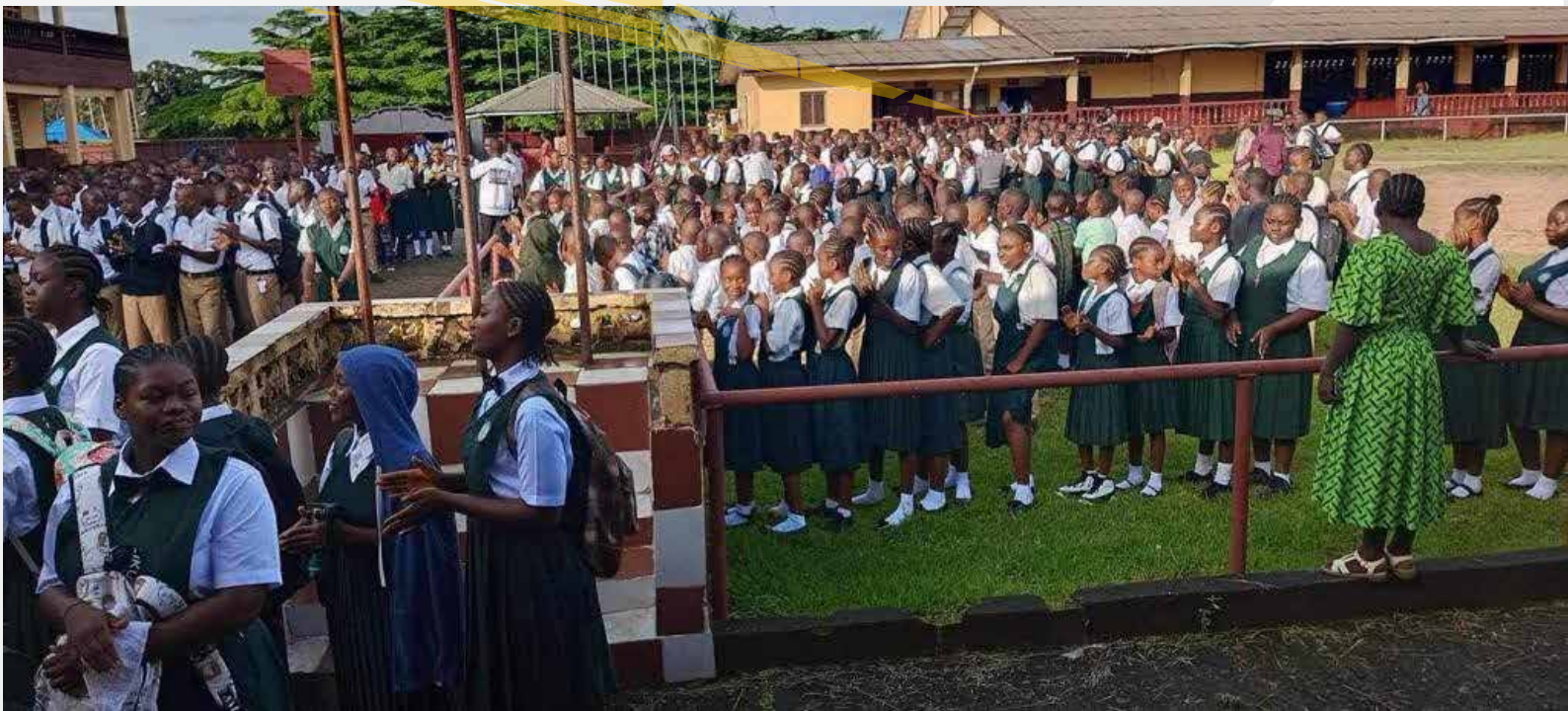
4th September 2023 marked the beginning of the 2023-2024 Academic year at Sister Shirley Kolmer Memorial Catholic School - Monrovia