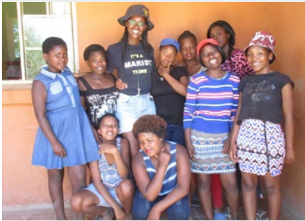
SOUTH AFRICA: YOUTH LEADERSHIP PROGRAMS AT MARIST MERCY CARE