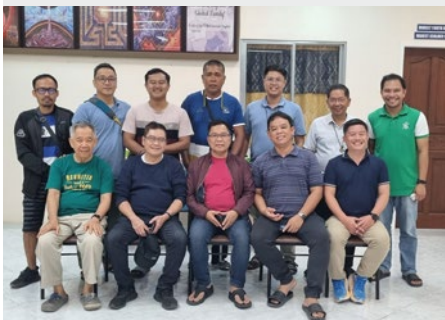
PHILIPPINES: COMMUNITY LEADERS OF THE MARIST BROTHERS PHILIPPINES SECTOR