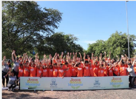
BRAZIL: MARIST SOCIAL GAMES