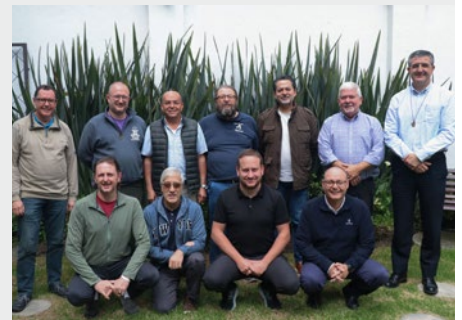
COLOMBIA: LEGAL STRUCTURES MEETING IN BOGOTÁ