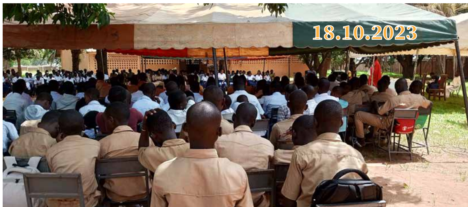
Collège Catholique Marcellin Champagnat, Korhogo having an open air Eucharistic celebration