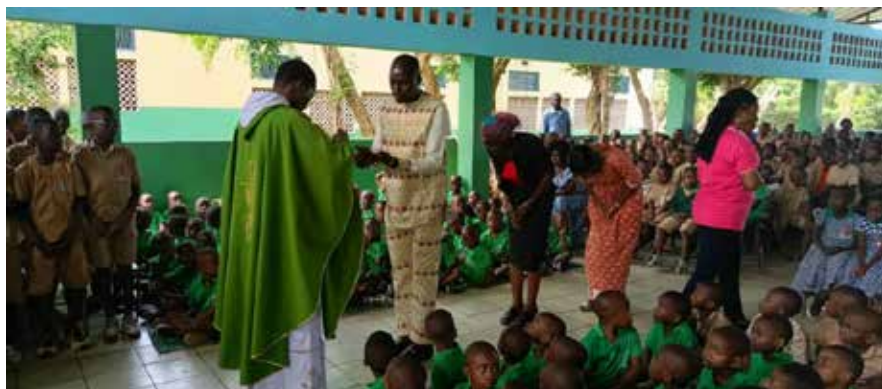
Centre Scolaire Saint Marcellin Champagnat Bouaké had the Opening Mass with the primary School pupils