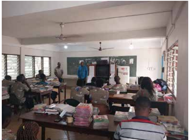
The Provincial had a session with teachers of the school