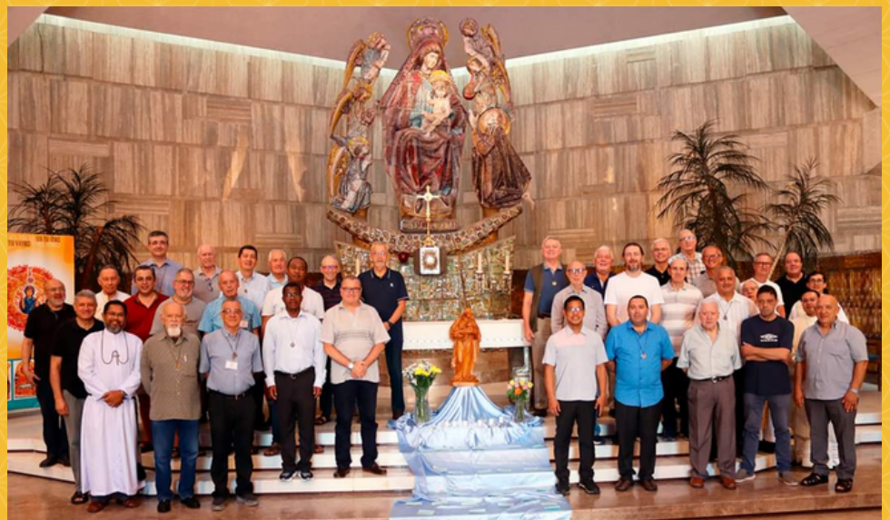
After the Mass to celebrate the birthday of Mary, September 8, 2023. Aside from the General Council and the General House communities, also in the photo were the brothers of the Amanecer Program (3rd Age, Spanish-Portuguese language), the team of the Formators Course 2024 and the brothers who attended the Tutti Fratelli Formation Program 2023.