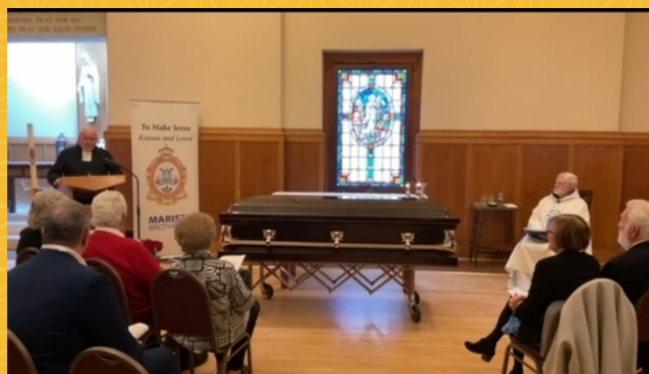
Photos taken during the Funeral service.