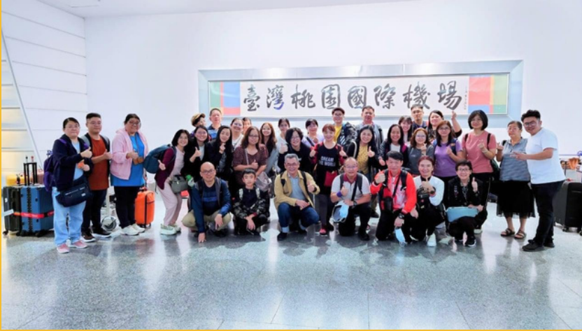
December 10: Catholic High School Sibuyan visiting Taiwan Schools of bench marking