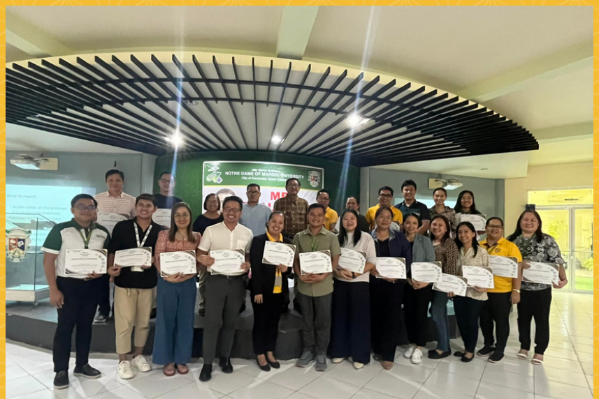
The participants with their certificates