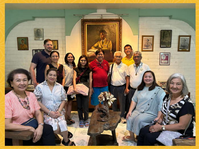
December 29: Relatives of General Paulino Santos visited the museum where his memorabilia are on display at NDDU.