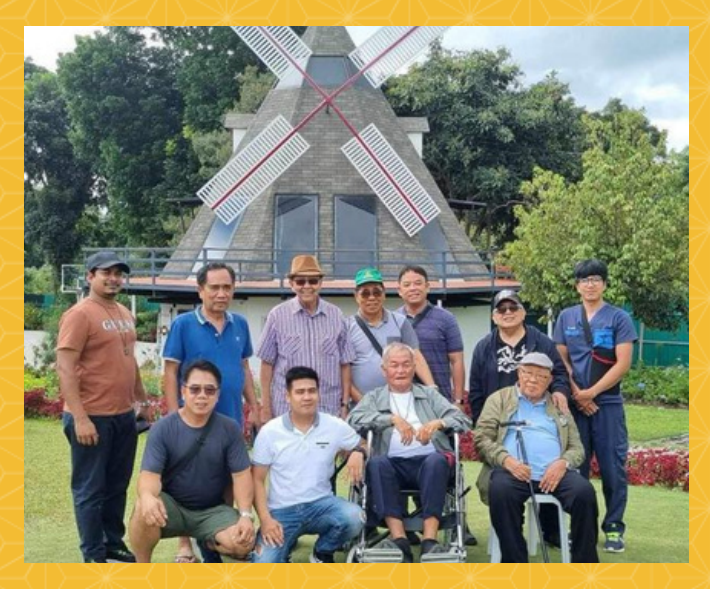
December 27: St. Joseph Community outing at SG Farm, Tupi, South Cotabato.