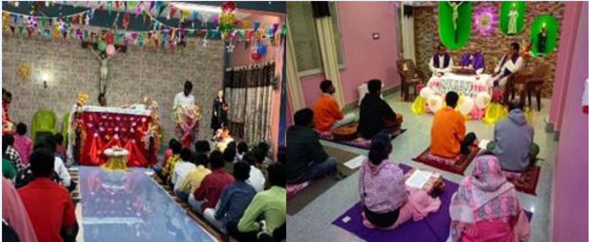
The Celebration of the Christmas Mass in the Hostel and our Saint Marcellin House.