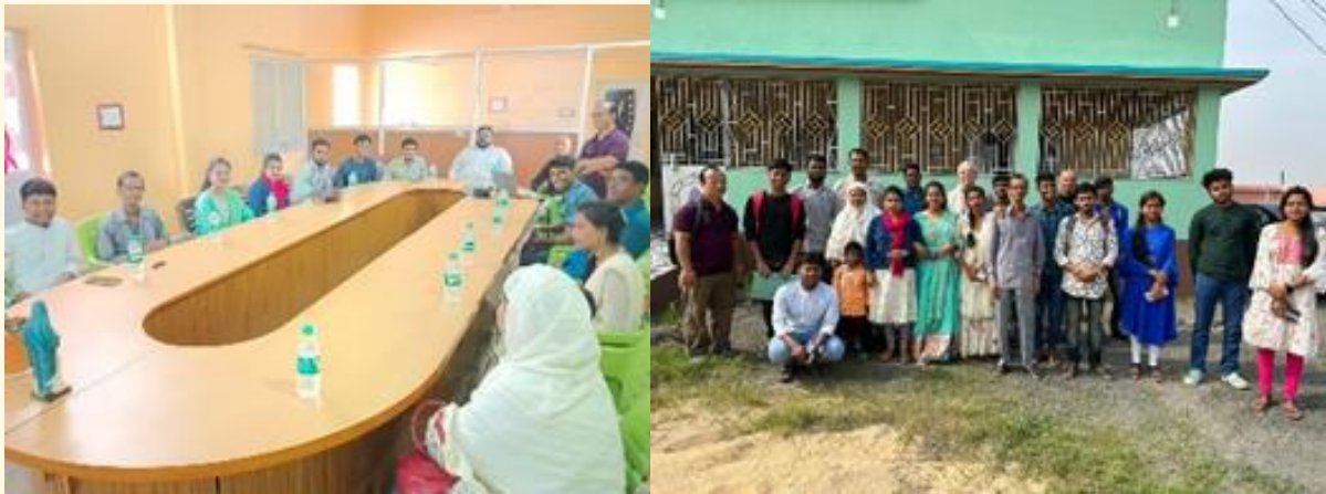
Closing Ceremony of the Community College. All the Teachers with the Marist Community.

The fifth event was the Closing Ceremony of the Community College on December, 5 th . We started the program with a meeting at ten o'clock with the teachers of the different study-centres and we finished with a fellowship meal. This was a Mini-Project from FMSI in six villages around Talit, from June to November. We will continue this project next January 2024.