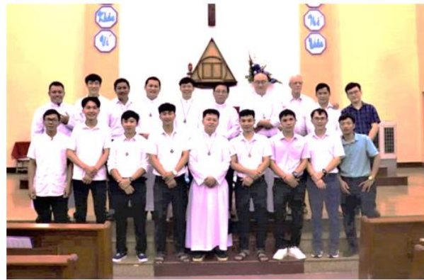
>>> The 3 Vietnamese communities (Saigon, Cu Chi, Ta Do) gathered in Ha Dong Parish to celebrate the foundation anniversary of the Marist Institute