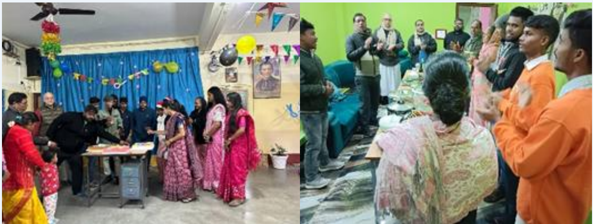
The Teachers cutting the Christmas Cakes for all the Hostel Boys. Christmas Celebration in our House.