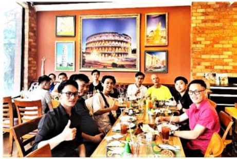
< Christmas party in Pizza Company