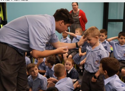
EL SALVADOR: MARIST HIGH SCHOOL CENTEN-NIAL CELEBRATION