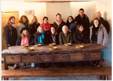
FRANCE: WEST CENTEAL EUROPE PILGRIMAGE IN LA VALLA

ses of restructuring. After Sister's talk, the brothers worked at tables with reflections based on their concerns and intuitions about this process.