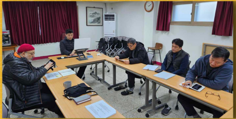
January 24: Seoul Community Evaluation Meeting

Last January 25, Marist-NDEA team finalized schedule of programs on advocacy against online sexual abuse and exploitation of children (OSAEC) for NDEA member schools. Upcoming activities will give focus on parents' awareness and their role in combatting threats in cyberspace and increasing awareness among students on the issue of online abuses affecting their well-being.