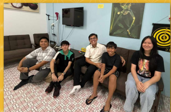
January 29: The Hostel students studying at Saint Joseph International School.